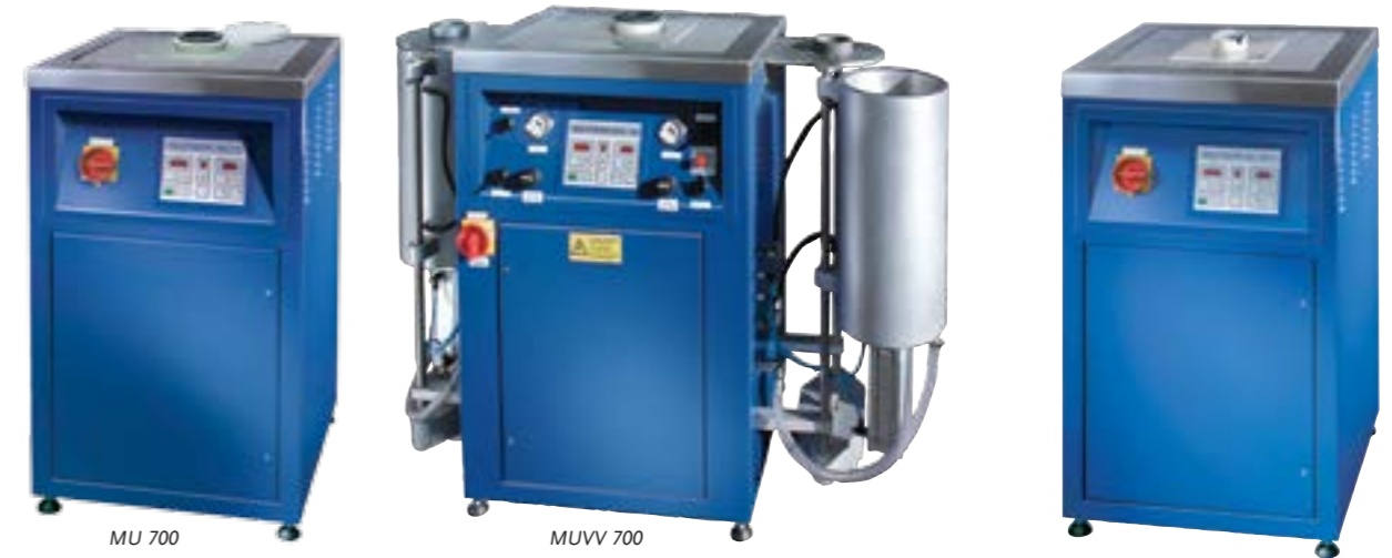
MU / MUV / MUVV series

Indutherm systems used in the recycling process